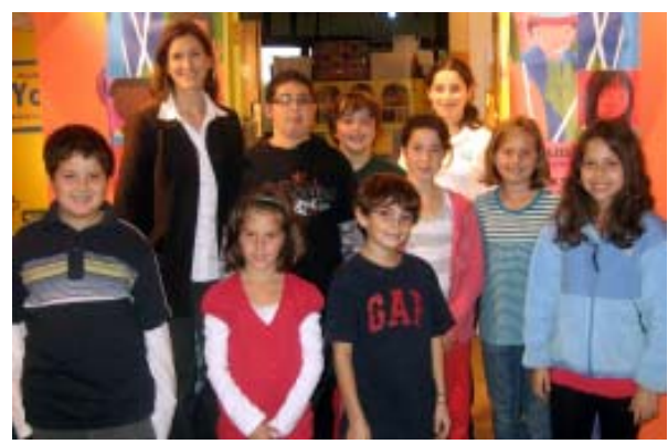
Beth Ahm's Religious School on a field trip to Shalom Street at the JCC.